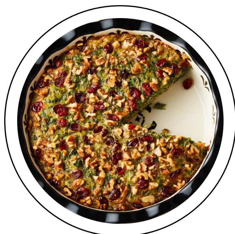
Persian Kuku Sabzi