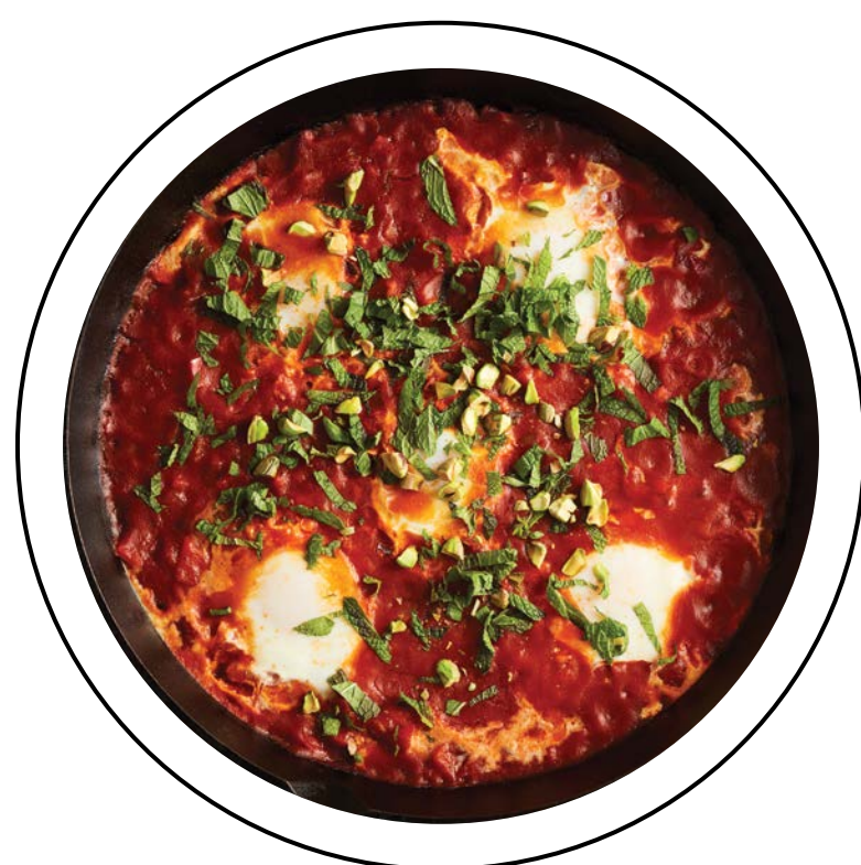
Stovetop Shakshuka With Pistachios and Mint